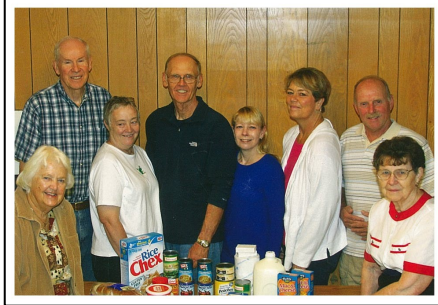
Volunteers several years ago