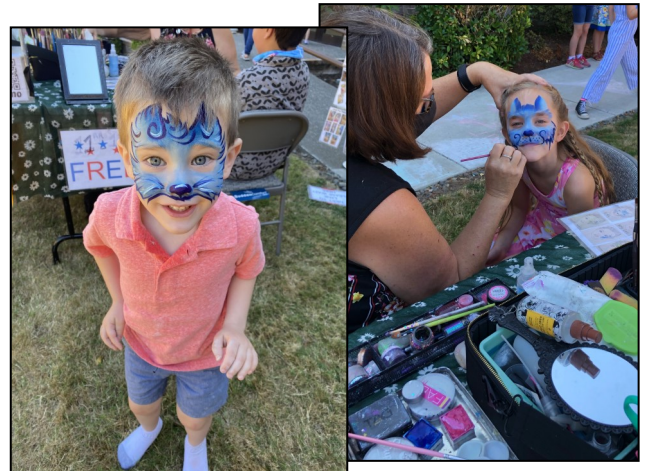
Face painting at recent "Back-to-School Bash"