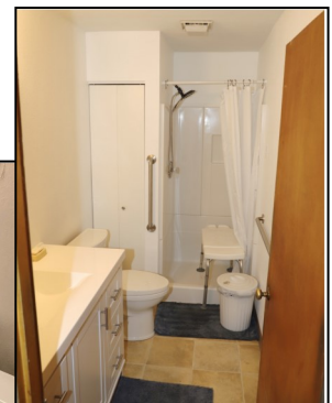
Bathroom Before and After